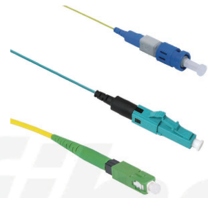
FUSEConnect Connectors (SC, LC, ST)