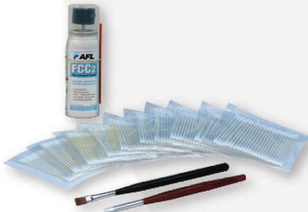
Splicer V-groove Cleaning Refill Kit