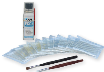
Splicer V-groove Cleaning Refill Kit