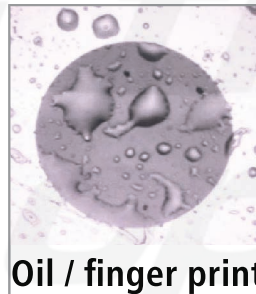
Oil / finger print