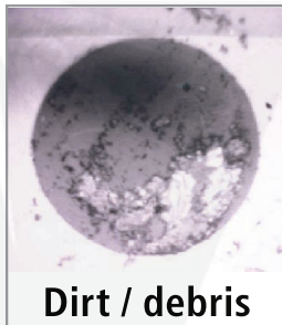
Dirt / debris