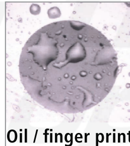
Oil / finger print