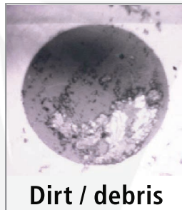
Dirt / debris