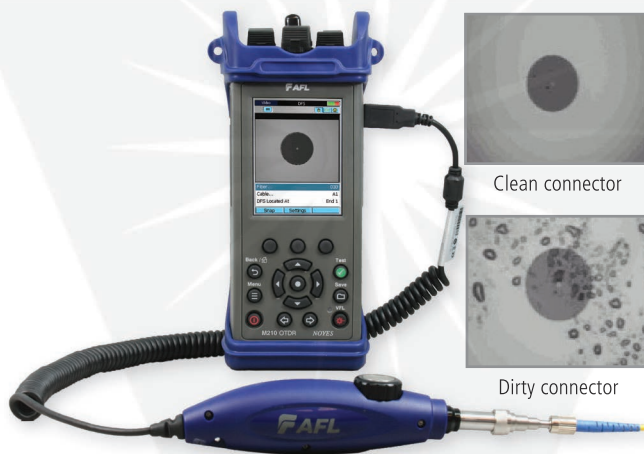
DFS1 Digital FiberScope with M210 OTDR