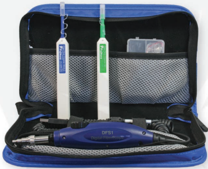
DFS1 Digital FiberScope Kit