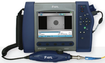
DFS1 Digital FiberScope with M700 OTDR