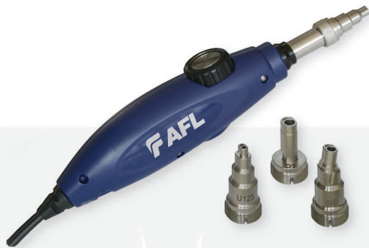
DFS1 Digital FiberScope