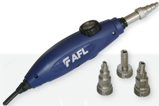
DFS1 Digital FiberScope