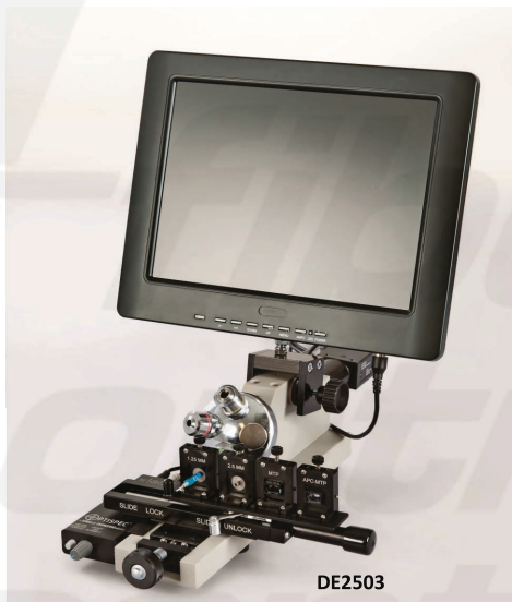
Monitor and adapters sold separately

Our Domaille Engineering OptiSpec® DE2503 video microscope is designed for large and small fiber optic cable assembly companies. The DE2503 accommodates bare fiber inspection as well as all of the standard connectors including the entire MT series of multi-fiber connectors. Blue LED illumination control eliminates previous industry standard light source issues and improves contrast on minor scratches.