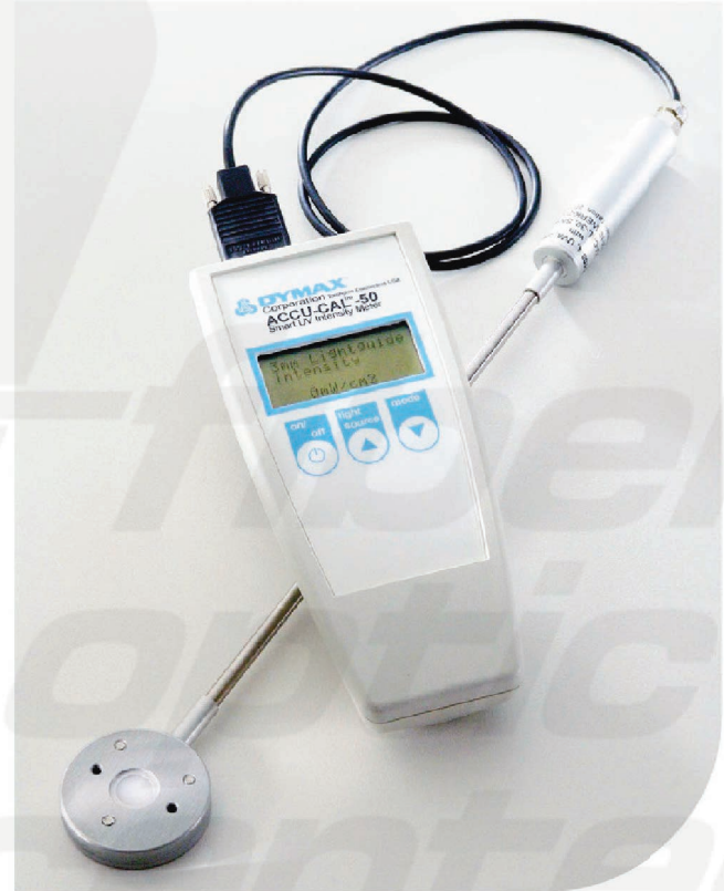
ACCU-CAL™ 50 for measuring floods and conveyors only PN 39561

Contact the professionals at Fiber Optic Center for a quote or to get more details.