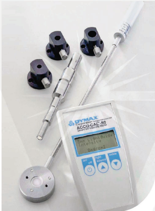
ACCU-CAL™ 50 for measuring spots, floods, and conveyors PN 39560

▶ Click here for more details on the Dymax ACCU-CAL™ 50 UV Radiometer for Measuring UV Curing Flood Lamps and Conveyors