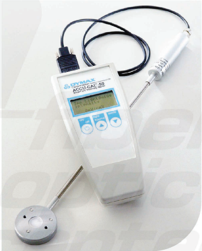
ACCU-CAL™ 50 for measuring floods and conveyors only PN 39561

Contact the professionals at Fiber Optic Center for a quote or to get more details.