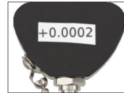
Back of Gauge

The gauge is designed for use with SMA905 fiber optic connectors during the polishing process to measure the height of the SMA ferrule. It is recommended to measure the height several times during the polishing process to ensure you do not over polish the connector. If the connector is overpolished then it will not function properly with its mating parts. The gauge should be ready to use out of the box and comes preset to the ideal SMA height of 0.3860" (see section 1.1 for details). The reading on the gauge with the included device pin should match the value printed on the back of the unit, as shown in the photo to the right. If the gauge does not match this value, please see the height reset section on page 4 before use.