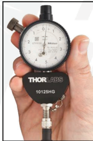
Figure 3 0.3860" SMA Ferrule

Note: The IEC standard for the height of an SMA ferrule is 0.3850" to 0.3863" (IEC61754-22).