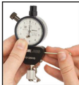
Figure 5 Coarse Adjustments

Contact the professionals at Fiber Optic Center for a quote or to get more details.