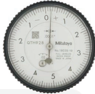
Figure 2 Gauge Properly Set to Device Pin