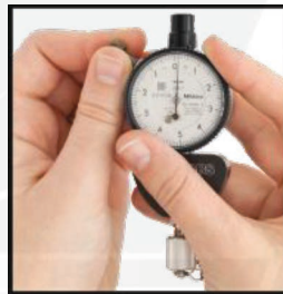
Figure 4 Fine Adjustments