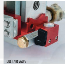
DUCT AIR VALVE