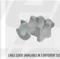
CABLE GUIDE (AVAILABLE IN 3 DIFFERENT SIZES)