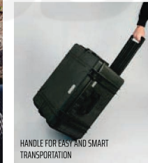
HANDLE FOR EASY AND SMART TRANSPORTATION

Contact the professionals at Fiber Optic Center for a quote or to get more details.