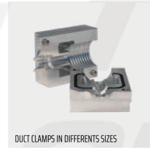
DUCT CLAMPS IN DIFFERENTS SIZES