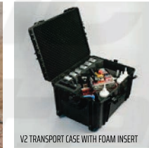
V2 TRANSPORT CASE WITH FOAM INSERT