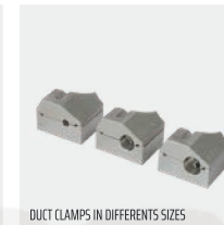
DUCT CLAMPS IN DIFFERENTS SIZES