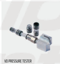
VO PRESSURE TESTER