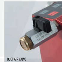
DUCT AIR VALVE