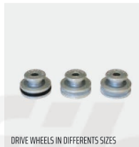
DRIVE WHEELS IN DIFFERENTS SIZES