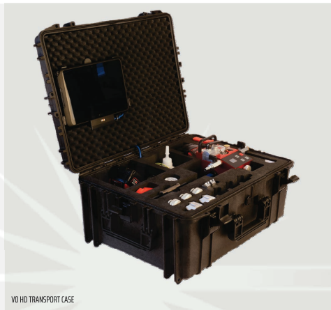
VO HD TRANSPORT CASE

▶ Click here for more details on the Jetting VO HD Fiber Blowing Machine