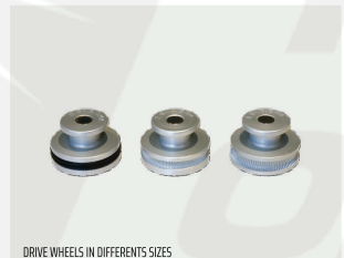
DRIVE WHEELS IN DIFFERENT SIZES