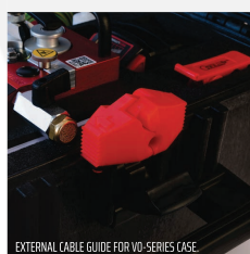
EXTERNAL CABLE GUIDE FOR VO-SERIES CASE