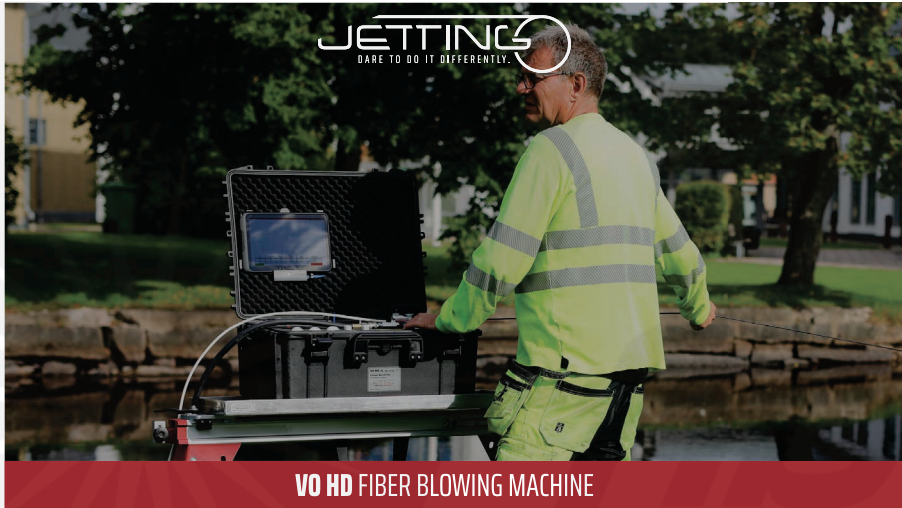
VO HD FIBER BLOWING MACHINE

▶ Click here for more details on the Jetting VO HD Fiber Blowing Machine