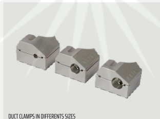
DUCT CLAMPS IN DIFFERENT SIZES