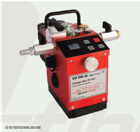
VO HD FIBER BLOWING MACHINE