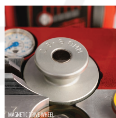
MAGNETIC DRIVE WHEEL