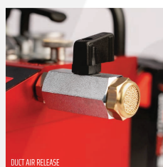
DUCT AIR RELEASE