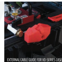
EXTERNAL CABLE GUIDE FOR VO-SERIES CASE