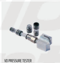
VO PRESSURE TESTER