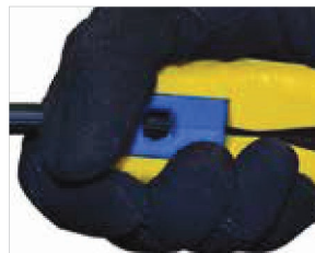
Long-lasting steel blade performs up to 5,000 cuts without dulling or reducing performance.