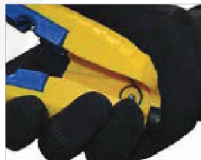
Low profile hinge & surface grip comfortably fit in hand for increased leverage & reduced fatigue.