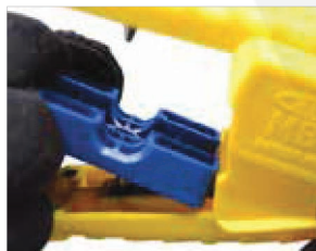
Magnetic trays accurately determine the appropriate blade depth & cable diameter to prevent damage.