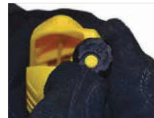
Recessed blade design & stowage lock provides safety & protects the blades while closed.

Contact the professionals at Fiber Optic Center for a quote or to get more details.