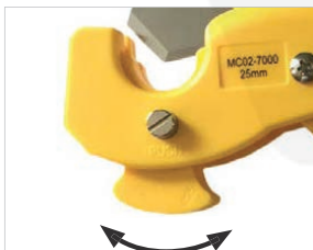
Adjustable size index secures the tubing in place for precision cutting.