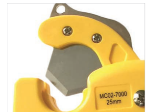
Fixed stainless steel blade requires no adjustments and replace easily.

Contact the professionals at Fiber Optic Center for a quote or to get more details.