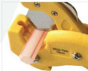
Recessed blade design & tool lock provides safety & protects the blade while closed.