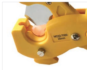
Unique heat-treated steel blade provides square, burr-free edges during cutting operations.