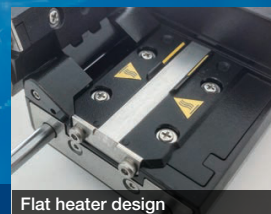
Flat heater design

Ideal for outdoor operation with bright LEDs, sound & vibration notifications and water-resistant body