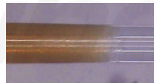
Polyimide stripping: Polymicro 330/300 μm, Polyimide coating shown.