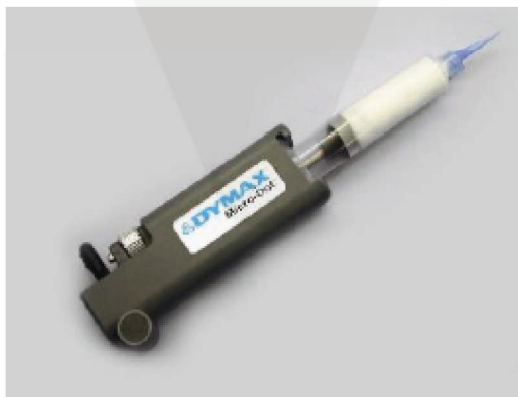
Figure 3. Micro-Dot (Thumb) PN T20000