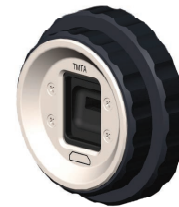
FMAX-TMTA: Inspection Adaptor for TMT Ferrule

Contact the professionals at Fiber Optic Center for a quote or to get more details.