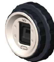
FMAX-TMTA: Inspection Adaptor for TMT Ferrule

Contact the professionals at Fiber Optic Center for a quote or to get more details.