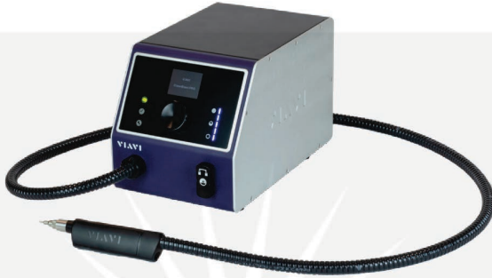
CleanBlastPRO end face cleaning system

The CleanBlastPRO is an automated cleaning system that ensures clean fiber end faces with reliable, repeatable and fast results at the push of a button.