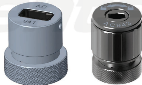
AC941: Patchcord testing MMC Adaptor

AC Detector Adaptors enable testing with the MAP series Optical Power Meters, Insertion Loss/Return Loss Meters and Swept Wavelength system.