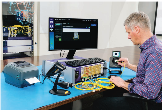
MAP-380 with PCT Test System

The PCT Test Solution consists of a powerful family of modules, software and peripherals for testing IL, RL, physical length, and polarity.