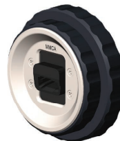
FMAX-MMCA: Inspection Adaptor for MMC

Dedicated FMAX series adapters enable inspection with the FVAi series.