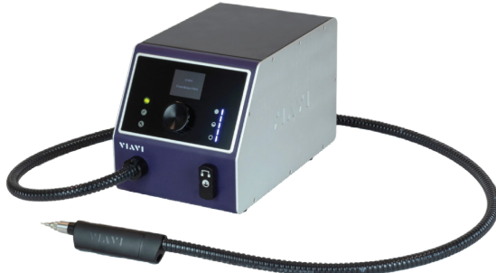
CleanBlastPRO end face cleaning system

The CleanBlastPRO is an automated cleaning system that ensures clean fiber end faces with reliable, repeatable and fast results at the push of a button.