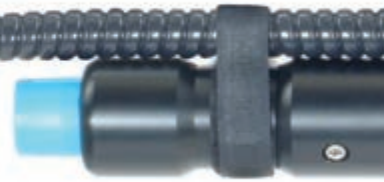
(FCL-B6000 and FCL-P6100 Series)