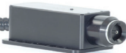
(FCL-B3000 and FCL-B4000 Series)

Various CleanBlast Adapters are available for most common connector types.