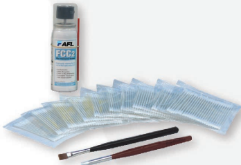
Splicer V-groove Cleaning Refill Kit