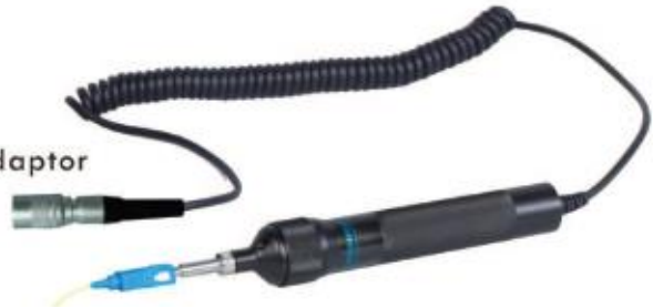
Durable Data Adaptor

Easyget uses aviation electrical plugs instead of USB connector compared to the previous version. The image of easyget will stay clean and stable even in the harsh environment.