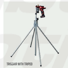
TRIGGAIR WITH TRIPOD