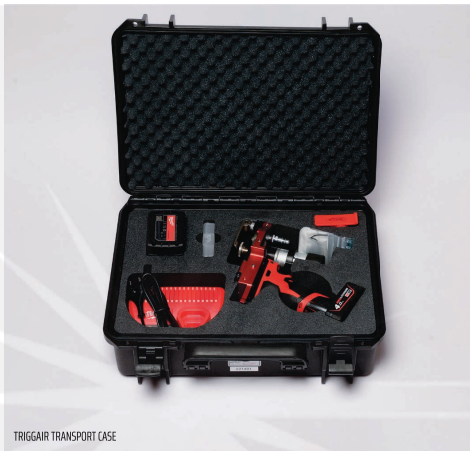
TRIGGAIR TRANSPORT CASE

▶ Click here for more details on the Jetting TriggAIR Handheld Fiber Blowing Machine