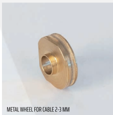
METAL WHEEL FOR CABLE 2-3 MM