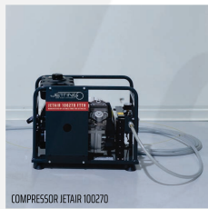
COMPRESSOR JETAIR 100270