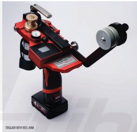
TRIGGAIR WITH REEL ARM