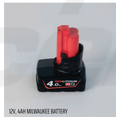
12V, 4AH MILWAUKEE BATTERY