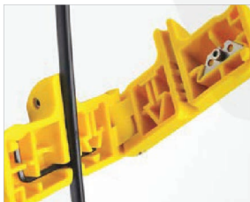
Hinged design opens to accept cable for end and mid-span applications without disassembling tool.