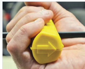
Close the tool onto the cable and pull in the direction of the arrow; clamps tightly — no latch required.