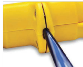
Precision blades easily cut through jacket without damaging fiber.