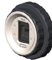
FMAX-TMTA: Inspection Adaptor for TMT Ferrule

Contact the professionals at Fiber Optic Center for a quote or to get more details.