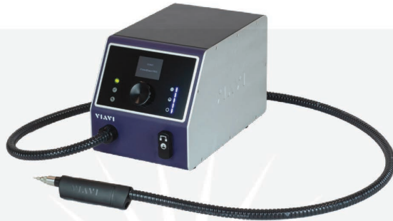
CleanBlastPRO end face cleaning system

The CleanBlastPRO is an automated cleaning system that ensures clean fiber end faces with reliable, repeatable and fast results at the push of a button.