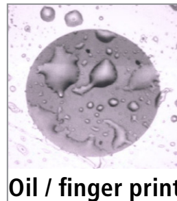
Oil / finger print