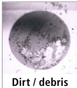
Dirt / debris