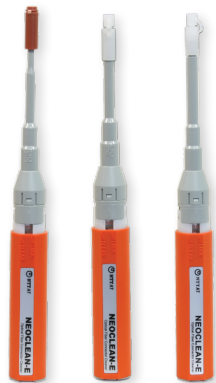
NEOCLEAN-E Models (E1, E2, E3)