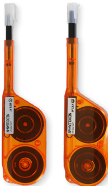
NEOCLEAN-M and NEOCLEAN-M2

NEOCLEAN-M2 is designed for cleaning MPO-16 and MTP-16 multi-fiber multi-row connectors used in data centers and other high-density optical network environments.