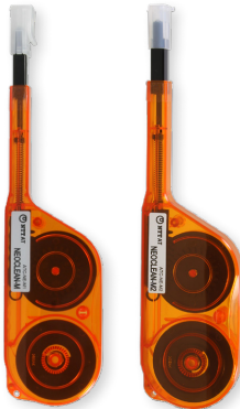
NEOCLEAN-M and NEOCLEAN-M2

NEOCLEAN-M2 is designed for cleaning MPO-16 and MTP-16 multi-fiber multi-row connectors used in data centers and other high-density optical network environments.