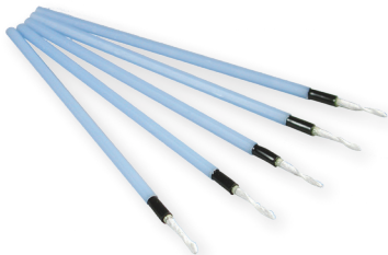
Type 1.25 mm