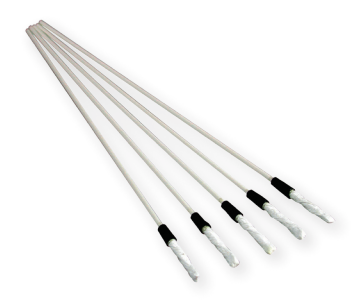
Type 2.5 mm