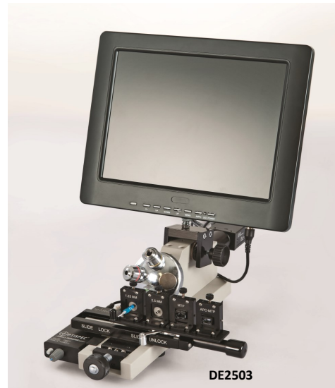
Monitor and adapters sold separately

Our Domaille Engineering OptiSpec® DE2503 video microscope is designed for large and small fiber optic cable assembly companies. The DE2503 accommodates bare fiber inspection as well as all of the standard connectors including the entire MT series of multi-fiber connectors. Blue LED illumination control eliminates previous industry standard light source issues and improves contrast on minor scratches.