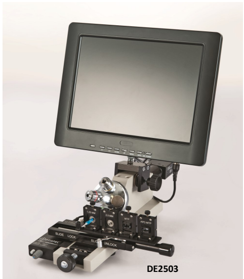
Monitor and adapters sold separately

Our Domaille Engineering OptiSpec® DE2503 video microscope is designed for large and small fiber optic cable assembly companies. The DE2503 accommodates bare fiber inspection as well as all of the standard connectors including the entire MT series of multi-fiber connectors. Blue LED illumination control eliminates previous industry standard light source issues and improves contrast on minor scratches.