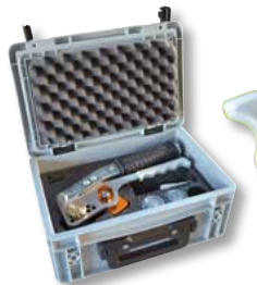
EASY FIBER DUCT SLITTER can be used with a wrench or a cordless drill in all positions. Comes in a sturdy box complete with support rollers for different duct sizes.

THE SAFE AND EFFICIENT DUCT TOOL. NO HARM TO TECHNICIANS OR FIBER CABLES