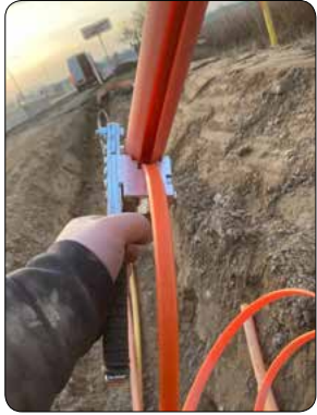
EASY FIBER DUCT SLITTER cuts a wide groove in the most commonly used duct types/sizes in one operation.

THE SAFE AND EFFICIENT DUCT TOOL. NO HARM TO TECHNICIANS OR FIBER CABLES