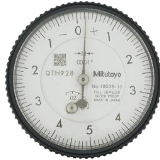
Figure 2 Gauge Properly Set to Device Pin