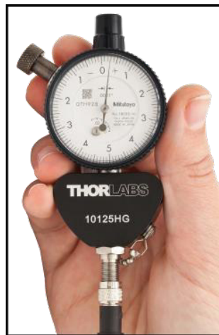
Figure 3 0.3860" SMA Ferrule

Note: The IEC standard for the height of an SMA ferrule is 0.3850" to 0.3863" (IEC61754-22).