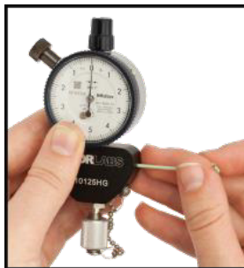
Figure 5 Coarse Adjustments

Contact the professionals at Fiber Optic Center for a quote or to get more details.