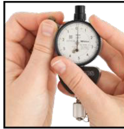
Figure 4 Fine Adjustments