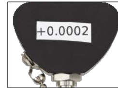
Back of Gauge

The gauge is designed for use with SMA905 fiber optic connectors during the polishing process to measure the height of the SMA ferrule. It is recommended to measure the height several times during the polishing process to ensure you do not over polish the connector. If the connector is overpolished then it will not function properly with its mating parts. The gauge should be ready to use out of the box and comes preset to the ideal SMA height of 0.3860" (see section 1.1 for details). The reading on the gauge with the included device pin should match the value printed on the back of the unit, as shown in the photo to the right. If the gauge does not match this value, please see the height reset section on page 4 before use.