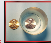
TUFFBOND® 321 OFFERS CLEAR & FLEXIBLE POTTING: