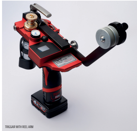
TRIGGAIR WITH REEL ARM