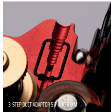
3-STEP DUCT ADAPTOR 5/16" (8 MM)