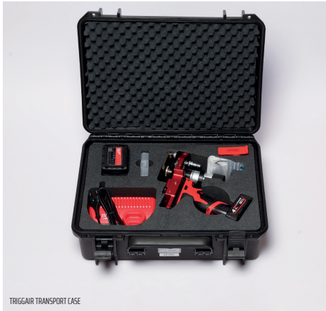
TRIGGAIR TRANSPORT CASE

▶ Click here for more details on the Jetting TriggAIR Handheld Fiber Blowing Machine