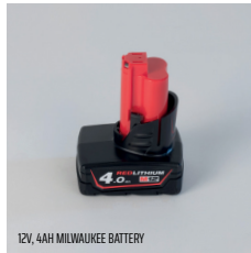
12V, 4AH MILWAUKEE BATTERY