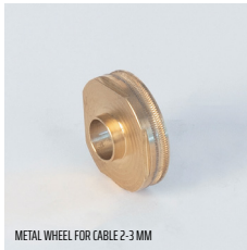
METAL WHEEL FOR CABLE 2-3 MM