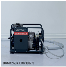
COMPRESSOR JETAIR 100270