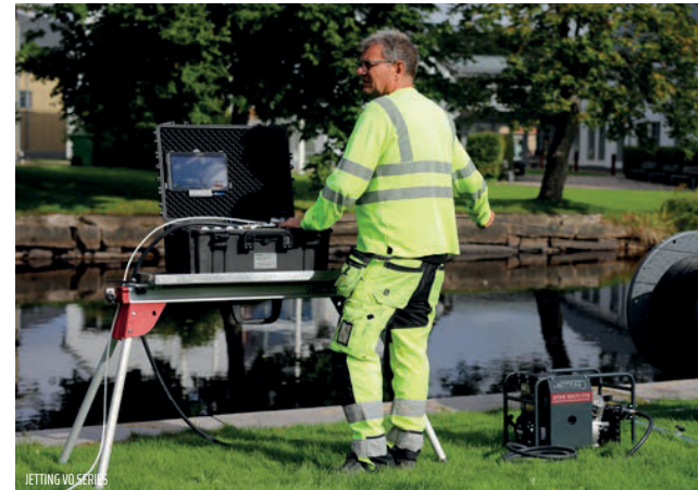
JETTING VO SERIES

Contact the professionals at Fiber Optic Center for a quote or to get more details.