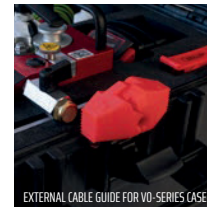
EXTERNAL CABLE GUIDE FOR VO-SERIES CASE