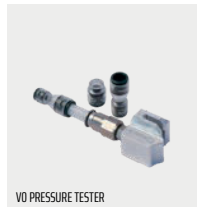
VO PRESSURE TESTER