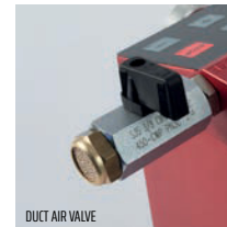
DUCT AIR VALVE