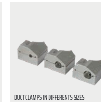
DUCT CLAMPS IN DIFFERENTS SIZES