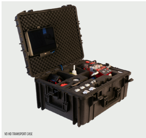
VO HD TRANSPORT CASE

▶ Click here for more details on the Jetting VO HD Fiber Blowing Machine