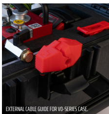
EXTERNAL CABLE GUIDE FOR VO-SERIES CASE