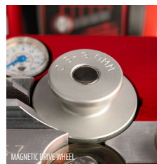
MAGNETIC DRIVE WHEEL