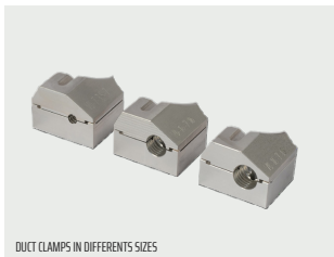
DUCT CLAMPS IN DIFFERENT SIZES