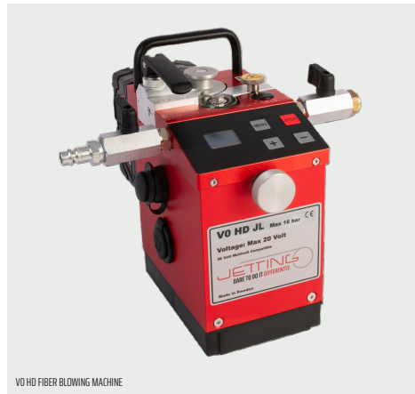
VO HD FIBER BLOWING MACHINE