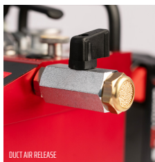
DUCT AIR RELEASE