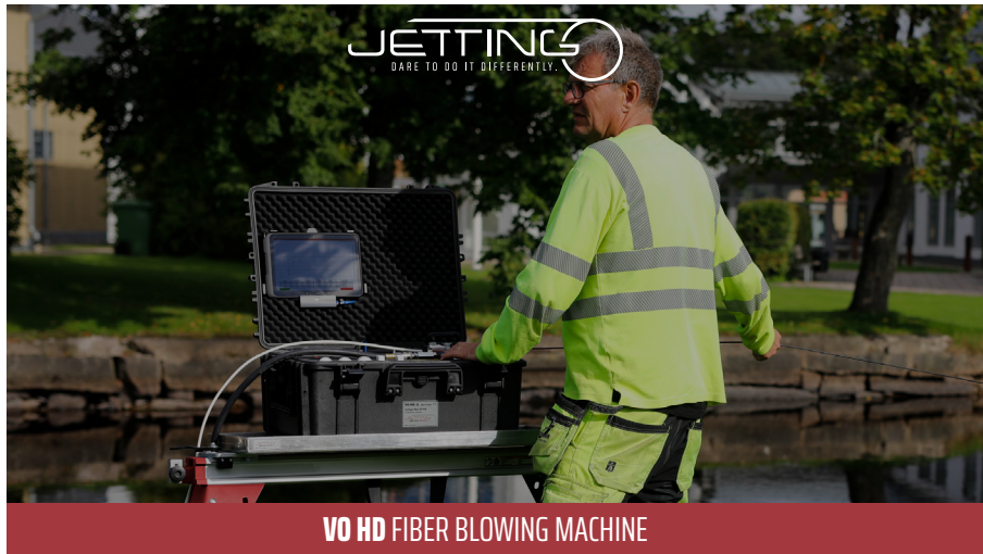
VO HD FIBER BLOWING MACHINE

▶ Click here for more details on the Jetting VO HD Fiber Blowing Machine with JetLogger Documentation System