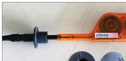
MCC-CCMPO-A (sold separately)