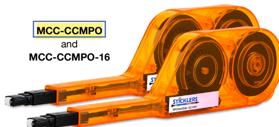
MCC-CCMPO and MCC-CCMPO-16

This rugged precision cleaner uses a smooth click-to-clean push-action, with light contact force to reduce the risk of end-face damage. With 600+ cleans, it is perfect for cleaning MPO connectors in high density cabling networks, data centers and CO's.