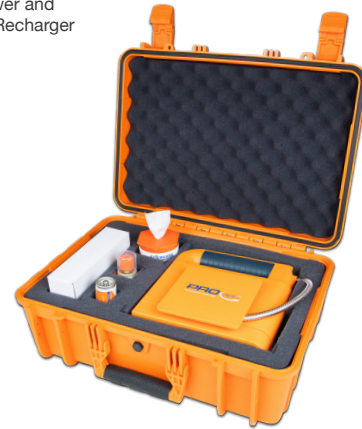
Kit shown with Sticklers Pro360° Touchless Cleaner Tool (MCC-P360) and Sticklers Pro360° Field Kit (MCC-P360FK)