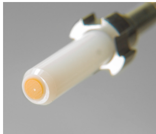
2.5mm SC ferrule, 75 µm cut