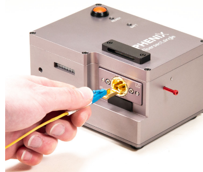
Inserting the LC connector

The fibersect.single™ quickly cuts off the epoxy and fibers protruding from the face of connector ferrules during the installation process. In less than a second, it produces a flat cut close to the ferrule face, creating the ideal surface for polishing. Throughput is improved by eliminating manual steps such as hand cleaving, de-nubbing and epoxy removal. The fibersect.single is optimized for cutting Simplex and Duplex epoxied connector ferrules. With a simple one button operation, small footprint, and battery power, the fibersect.single provides exceptional versatility, portability, and ease of use in the production environment.