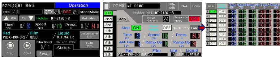
Interface of A3C model consumables info input & control