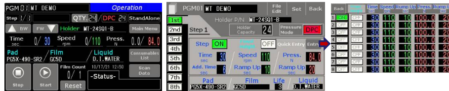
Interface of A3C model consumables info input & control