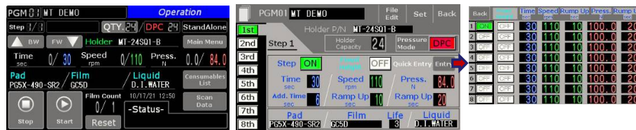
Interface of A3C model consumables info input & control