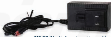
MS-T3 (North American / Japan Shown)